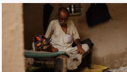
A Tuberculosis patient in Delhi.

This article stated that India and few other countries like Indonesia, South Africa and Philippines registered a decline in the notification of Tuberculosis (TB) cases during the COVID-19 lockdown. Some of the plausible reasons identified for this decline have been elucidated by the author. The author concludes that the current economic contraction in the country has forced the government to divert resources meant for TB mitigation to COVID-19 response which will hamper meeting the targets of 2020 milestones of “End TB strategy”. >>Read Article